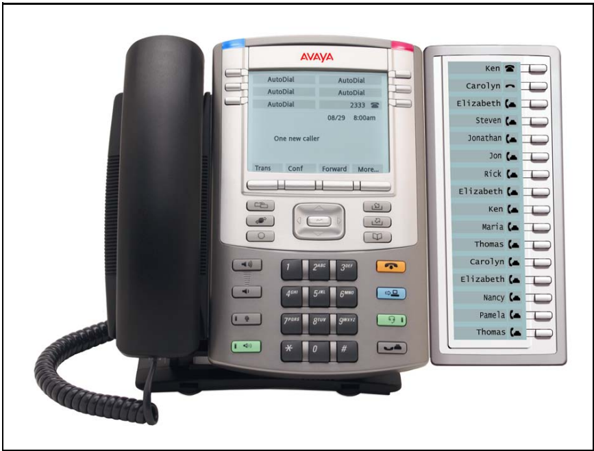
Figure 1: Avaya 1140E IP Deskphone with Expansion Module